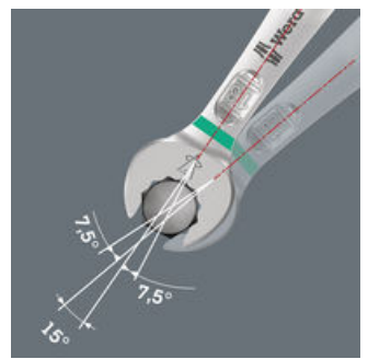
Thanks to the open end side offset by 7.5°, double hexagon geometry and an adjusted application method (placement - screwdriving - turning - replacement - screwdriving - turning, etc), even screwdriving challenges allowing a pivoting angle of less than 30° can be solved.