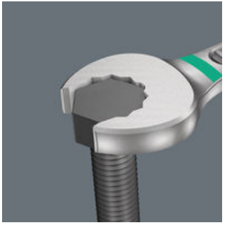
The double hexagon geometry on the open end and ring sides secures the positive connection with the screw head or bolt and reduces the risk of slipping.